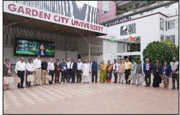
The team along with the advisory committee and the conference organizing team at the GCU Campus.