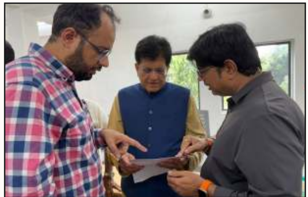
ICA Executive member inviting the central govt commerce minister Shri. Piyush Goyal, Minister of Commerce and Industry